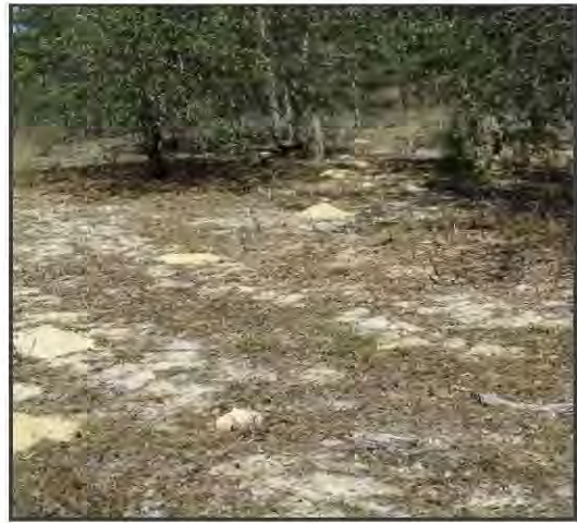
Figure 2: Pocket gopher mounds in pine snake habitat.

Population declines of Florida pine snakes have been suspected since the 1970s (Franz 1992). As habitat specialists, Florida pine snakes are dependent on habitat structure associated with the longleaf pine forest, such as an open forest canopy, a reduced midstory and understory, and robust groundcover. However, the current distribution of longleaf pine forest has been reduced to about 3% of its historic range (Ware et al. 1993), including significant losses of sandhill and scrub habitat within Florida (Kautz et al. 1993, Enge et al. 2003). Because the Florida pine snake has specific habitat requirements, continued habitat loss due to land development and conversion may further imperil this species.