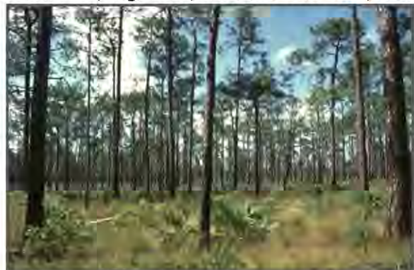
Figure 1. Pine upland habitat used by pine snakes.

Southeastern pocket gopher colonies are important to sustaining populations of Florida pine snakes. Florida pine snakes often prey on pocket gophers (Franz 1992, FWC 2011), primarily use pocket gopher burrows as refugia (Miller et al. 2012) and, where available, may use pocket gopher burrows as egg deposition sites (Franz 2005). Areas without pocket gophers also support pine snakes. In these areas, pine snakes may use gopher tortoise burrows, nine-banded armadillo ( Dasypus novemcinctus ) burrows, and stump holes as