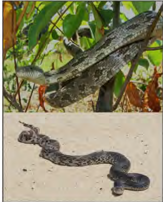
Figure 4: Gray rat snakes (top), typically found in the Florida panhandle, are similar in size and appearance to Florida pine snakes (bottom).

Florida pine snakes may also be encountered during gopher tortoise burrow surveys, or during gopher tortoise relocation activities. Snakes may be incidentally encountered while using a burrow scoping system (an activity which requires a permit), while excavating gopher tortoise burrows, while checking bucket traps set for gopher tortoises, or while walking survey transects for burrows. The presence of Florida pine snakes on gopher tortoise relocation sites should be recorded during data collection and submitted to FWC in accordance with gopher tortoise relocation permit conditions. Florida pine snakes must be handled and released in accordance with permit conditions pertaining to the relocation of priority commensal species. Further information regarding gopher tortoise surveys and related permitting needs may be found in Appendix 9 of the Gopher Tortoise Permitting Guidelines (FWC 2017).