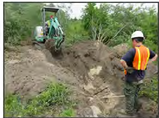
Figure 3. Using heavy machinery to excavate gopher tortoise burrows is an example of an activity that will compact soils and may take pine snakes.

Snake fungal disease is an emergent threat to wild snakes, and has been documented in at least 10 states, including Florida (Sleeman 2013, Glorioso 2016). In New Hampshire, snake fungal disease may have been a factor in the 50% decline of an imperiled population of timber rattlesnakes ( Crotalus horridus ; Clark et al. 2010, Sleeman 2013). Because little is known about snake fungal disease, and pine snakes are difficult to monitor, any effects of snake fungal disease may be difficult to quantify. Providing any dead specimens to FWC will help monitor for this disease.